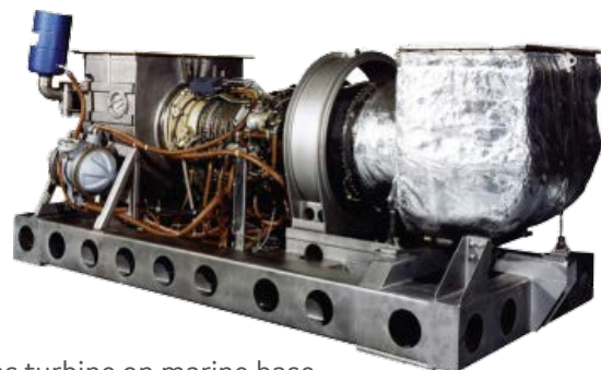
4.6 MW marine gas turbine on marine base