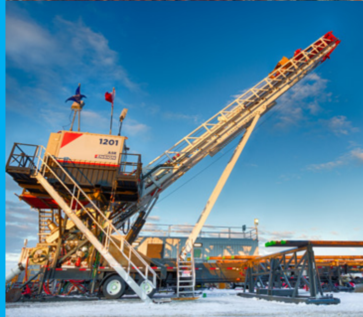
ABOVE: Ensign's ASR 150, a fully automated service rig.