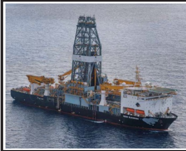
Ultra Deepwater Drillship